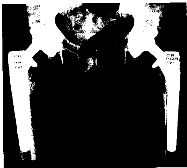
Fig. 4. Radiographs of bilateral total hip arthroplasties 7 years after surgery. The right hip is a hydroxyapatite-coated stem, which has osteolysis under the collar. The left hip is a porous-coated only stem, which has osteolysis in all zones around the stem. There is significant wear with both hips which is equal.

The use of comparison of results of arthroplasty surgery by using bilateral operations in the same patient has been previously reported. Wiesman et