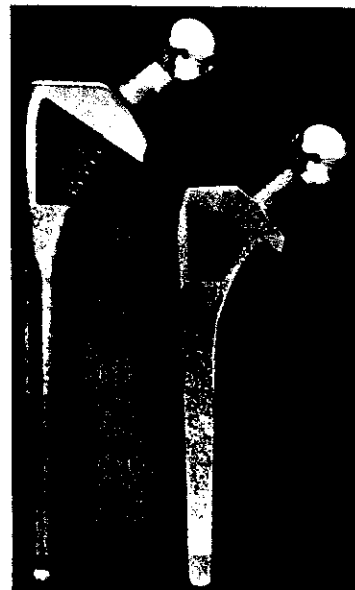
Fig. 1. The stem on the right side of this figure is the anatomic porous replacement-I with patched porous coating. On the left is the anatomic porous replacement-II which has no porous coating on the lateral side of the stem.

The anatomic porous replacement-I hip stem was made of titanium alloy and had cancellous-structured patched porous coating placed on the proxi-