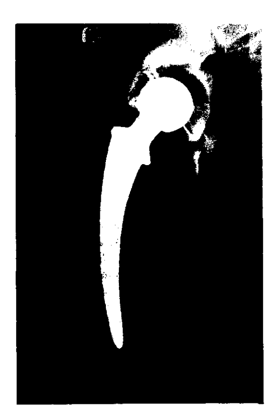
Fig. 3. Osteolysis of the proximal femur with a stem that remains well fixed. The socket shows osteolysis and migration, which may be tolerated by the patient.

This study had an average follow-up time of 9.2 years, which was five years more than