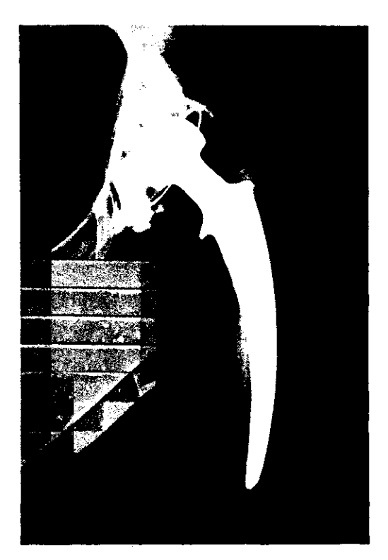
Fig. 1. A loose stem and socket with osteolysis of the proximal femoral bone.

Twenty-nine patients (of 81) required removal of components. Two had late hematogenous infection, and 27 had revision for aseptic mechanical failure. Thus 36% of the patients had components removed, and 33% were revised for aseptic failure. In the first five years postoperatively, three femoral components and one socket were revised; between five and ten years, four femoral components, three sockets, and both components in 11 hips were revised; between ten and 15 years, one socket and both components in four hips were revised. Examination of revision by components does not indicate the rate of loose components because often at the time of revision for one loose component, the other was also changed. Seven of the 27 revisions have had a second revision between two and ten years after the first revision. One hip had a third revision. In hips that required revision for a loose femoral stem, osteolysis of cortical diaphyseal bone was present in 100% (Fig. 1). The two late infections occurred at seven and 13 years. One was caused by Hemophilus influenzae, which originated in a sinus infection; and one was due to alpha streptococci of unknown origin. A third infection after revision also occurred in this part of the study.