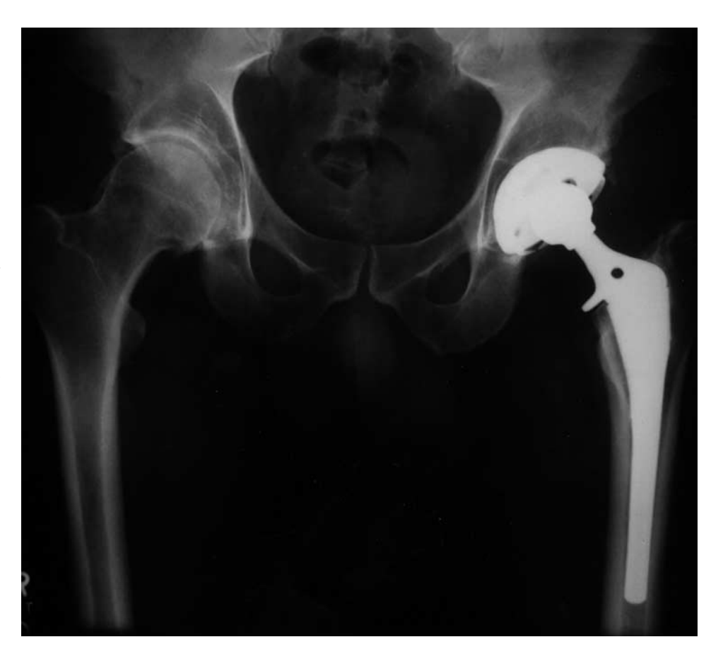
Fig. 2. Anteroposterior pelvic radiograph of patient with lateralized cup as indicated by protrusion lateral to the edge of the cotyloid notch. The offset of the hip also is increased.

When the psoas tendon is released, a curved osteotome (0.5 inch) is used to release the anterior